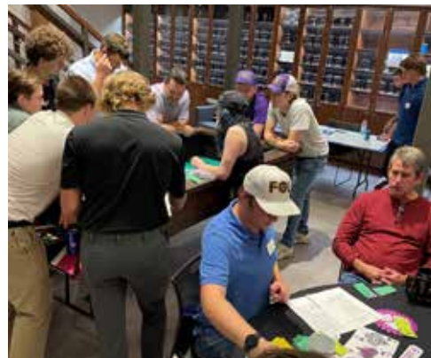
Casino Night: Poker, Roulette, Craps, Blackjack!