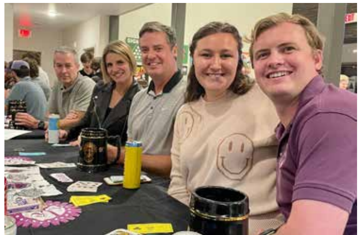
Alumni enjoying Casino Night