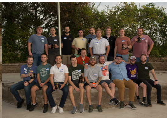
Recent Alumni (last 11 years)