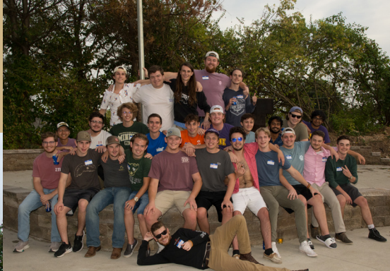
The Undergraduate Active brotherhood