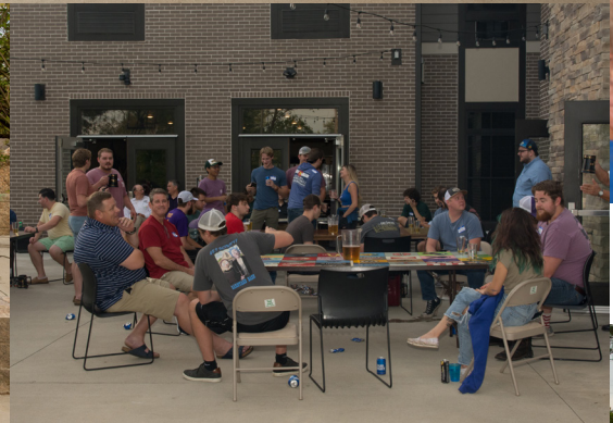
Socializing out on the back patio