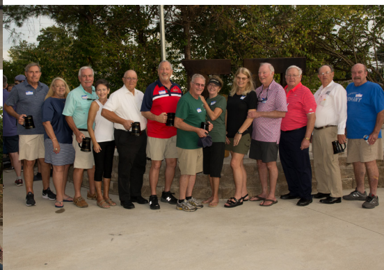
60s/70s alumni and spouses