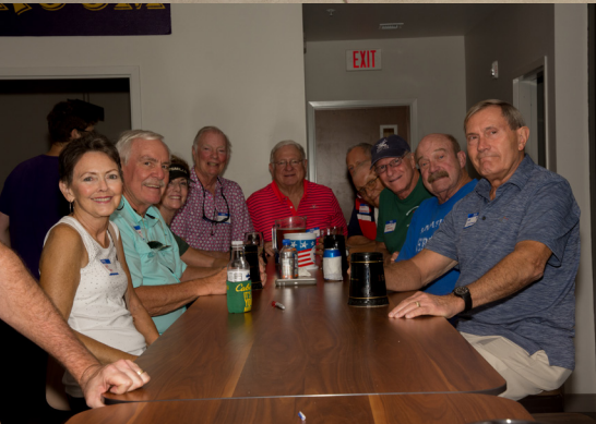
60s/70s alumni and wives telling stories