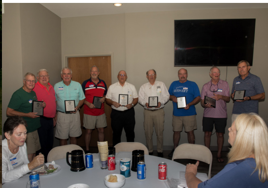
New honorees for 50 years of service to the fraternity

The Alpha Iota Educational Foundation (AIEF) is the 501(c)3 charitable organization that supports the undergraduate chapter. Donations to the AIEF are tax-deductible and support several programs including scholastic-based financial grants, scholarships, and much more.