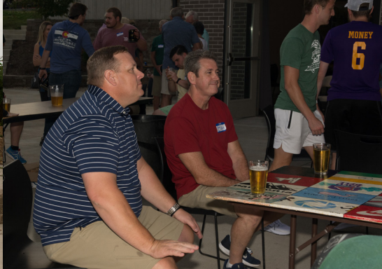
2 distinguished alumni engaging in a social game Socializing out on the back patio