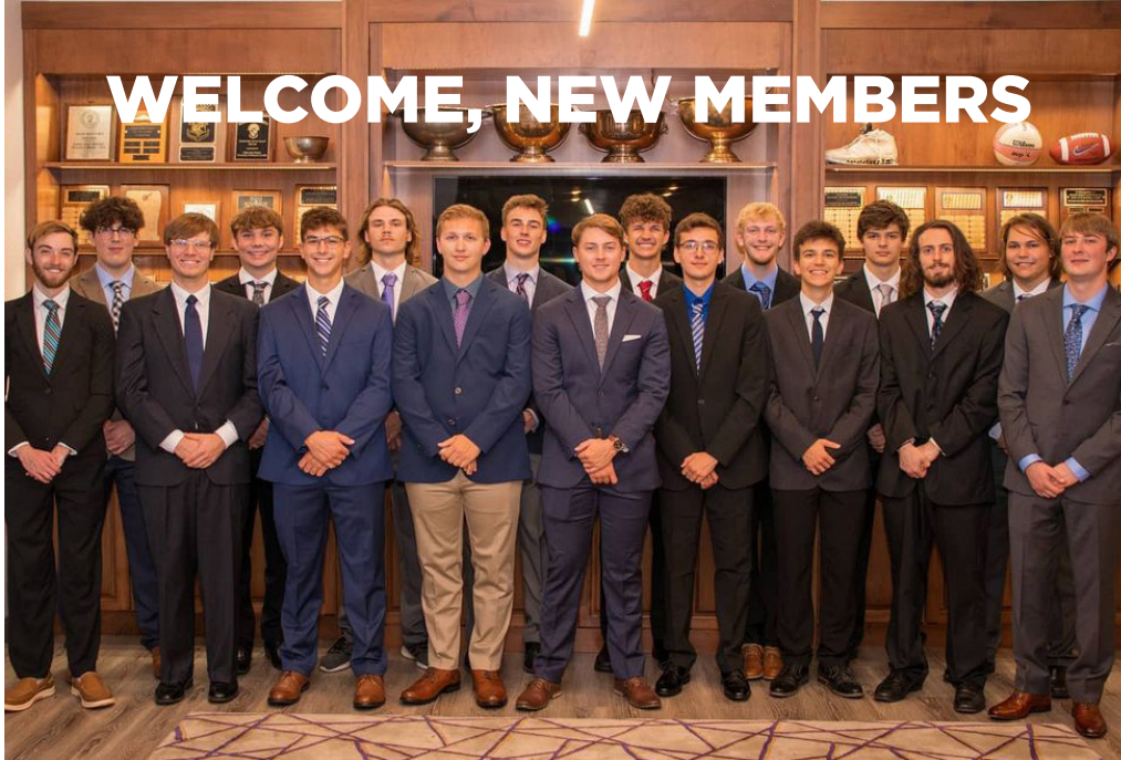
Pictured from left to right: